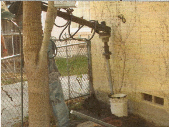
This can be done till they get closer towards utility room. Then use portable Unit.