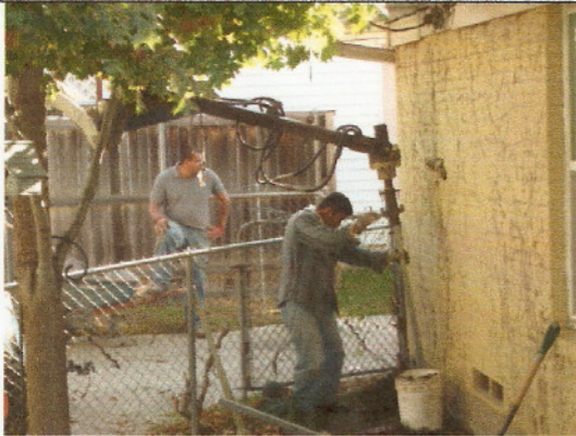
More efficient from the old days for sure