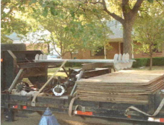
7 ea. Helical Piers with GH Brackets