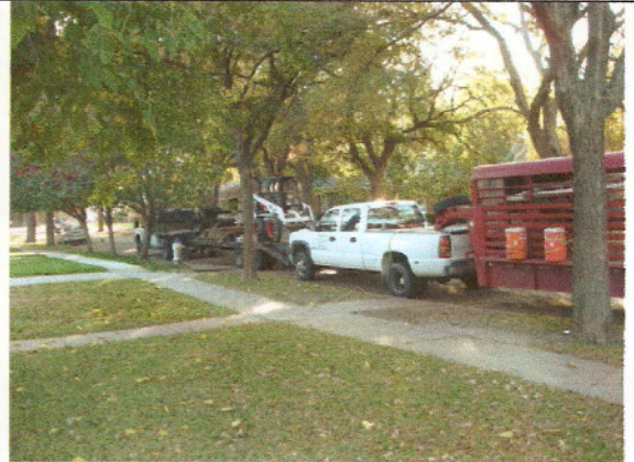
They came in full preparation