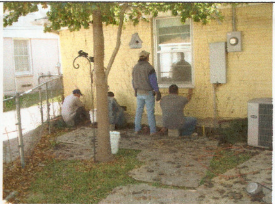
This is where men would push when told and inside man measured.